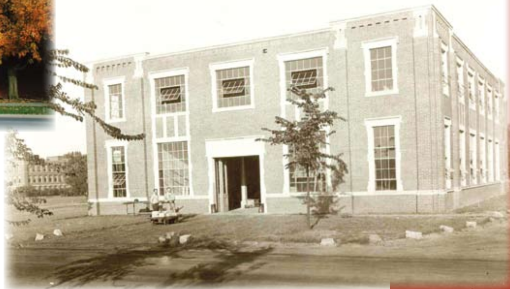
Sweeney Hall in 1927

Please stay in touch at 515 294-7642 or cbe@iastate.edu .