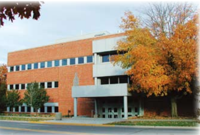
Sweeney Hall today